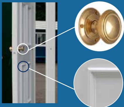
Deluxe Door Details

With Sitesafe door and window assemblies you get the ability to secure your existing buildings with the same level of security that is fitted across our entire range of secure portable units - but at a fraction of the cost.