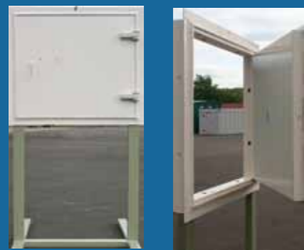
Standard Commercial Window