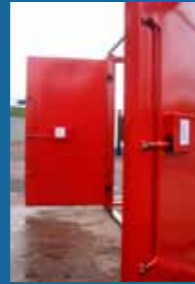
Industrial Door - Double