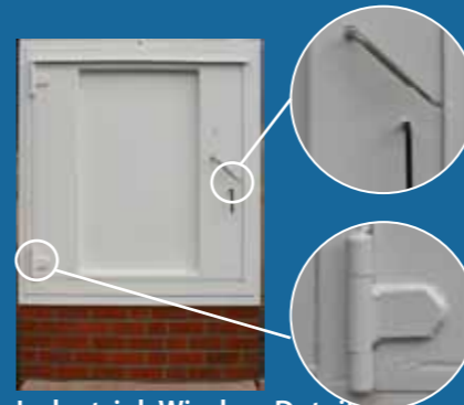
Industrial Window Details

Made to measure industrial doors supplied with:- 7-lever lock, allen key operation, anti-jemmy strips, 100mm x 100mm box section outer frame, 3-point internal locking