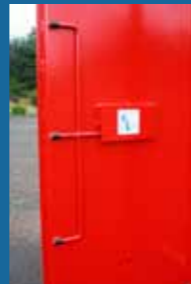
Interior Locking Bolts