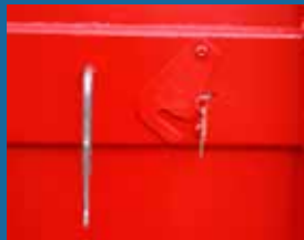
7-Lever Lock & Allen Key Operation